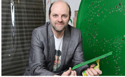
Gavin Turk, formerly one of the Young British Artists, is now an established force in the British art world.