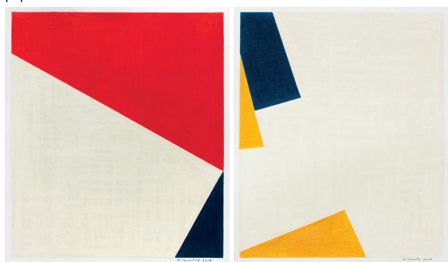
Keith Coventry | Junk I & II | 2014 | Oil Stick and Pencil Crayon on Paper | 59.5 x 50 cm

On a recent visit to South Africa to attend the exhibition of South African born, British artist Helen A Pritchard at SMAC Art Gallery in Cape Town, Keith Coventry was impressed by the local art scene and the interest shown towards contemporary British art, in particular the so-called YBA (Young British Artists) generation, amongst whom Coventry was a central figure. Coventry suggested presenting and curating (together with Pritchard) an exhibition of works on paper by some of his artist friends from the UK. The show contains work by many of the important YBAs, as well as younger artists from the current generation, including three Turner Prize winners and many well-publicized and controversial Turner Prize nominees. A spirit of generosity from the curators and the participating artists underpins this exhibition that explores the often overlooked qualities of art produced on paper.