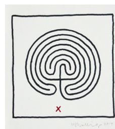
Mark Wallinger | Untitled | 2014 | Ink on Paper | 29.5 x 20.9 cm

Despite a historic slant (the show spans more or less two decades), it also includes fresh and exciting new works such as a labyrinth drawing by Turner Prize winner Mark Wallinger, who has just been commissioned to produce 270 monumental public works on this theme to be placed permanently in various locations on the London Underground. Further examples include a large, elaborate and typically colourful mixed media work by Keith Tyson (another Turner Prize winner) and two delicate collage works of autumn leaf shaped cut-outs of pages from pornographic magazines by Jonathan Yeo, who recently presented a major exhibition at the National Portrait Gallery in London. These and other works make this exhibition very current and as much about the 'now', as about recent history.